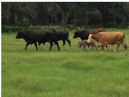
Beef Cattle, Sod, and Hay

Congratulates Altrusa Club and Altrusa House on their 60 th and 20 th Anniversaries